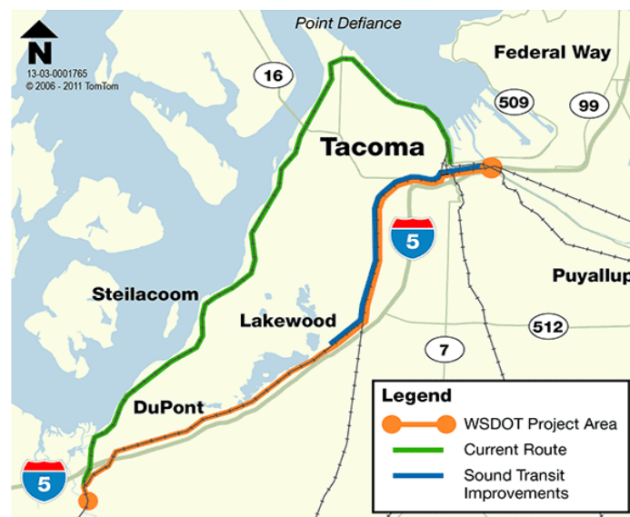
Rail - Tacoma - Bypass of Point Defiance - Project Map